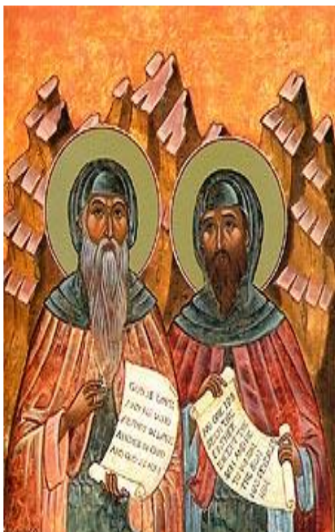
Barsanuphius the Great and John the Prophet