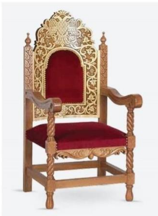
25 velvet wood carved chairs for the Holy Sanctuary. $1,500 each.

The Parish of St Nektarios is seeking donors for the following items