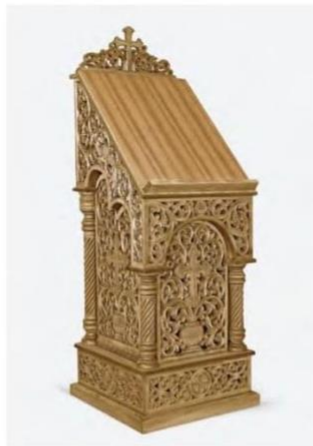
2 proskynitaria (icon stands) $4,000 each.