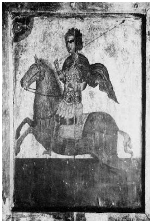
Ilyan of Homs