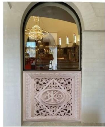
2 custom frame wood carved panels for church entrance. $8,700 each.