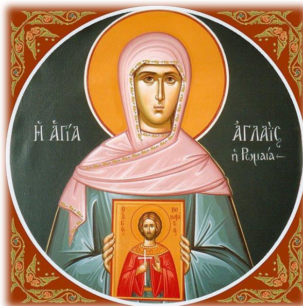
Aglaia the Righteous of Rome