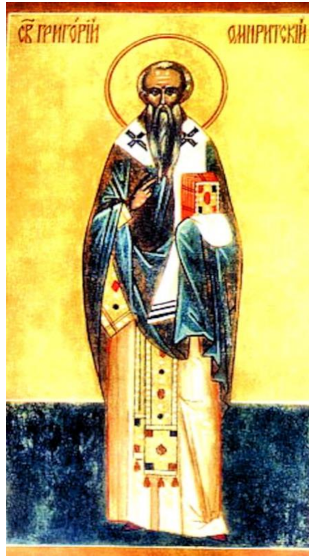
Our Righteous Father Gregentius, Bishop of Ethiopia