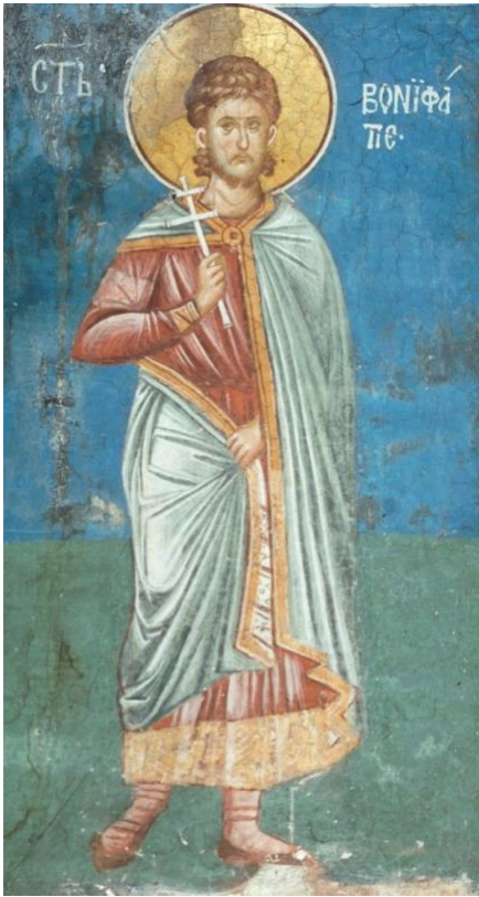
Boniface the Merciful of Tarsus