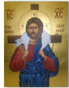
The Good Shepherd by a 4th year Student

Please reserve your place early either by email or phone before the commencement date so that the materials can be ordered.