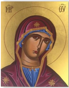
Panagia by a 3rd year student