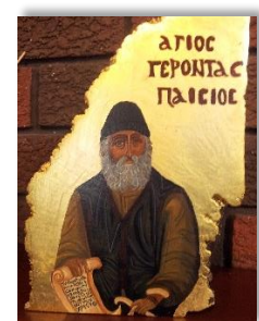
Saint Paisios by a 4th year student