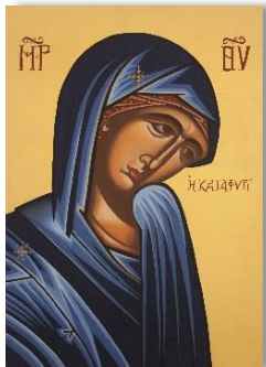
Panagia Katafigi by a 3rd year student