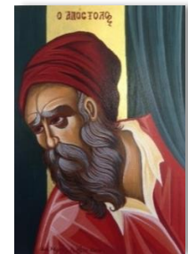
The Apostle by a 4th year student