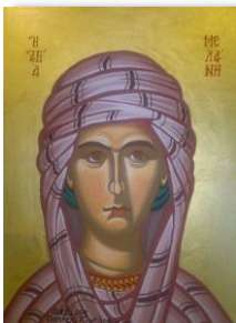
Saint Melani by a 3rd year student