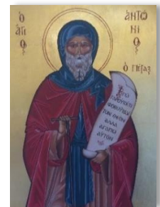
Saint Anthony by a 4th year student