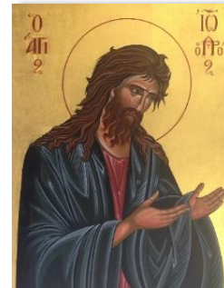
Saint John the Baptist by a 4th year student